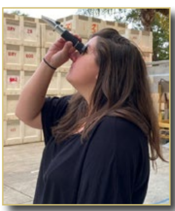
<> Looking inside we see a Brix measurement of 24, just right for producing a vibrant Viognier!